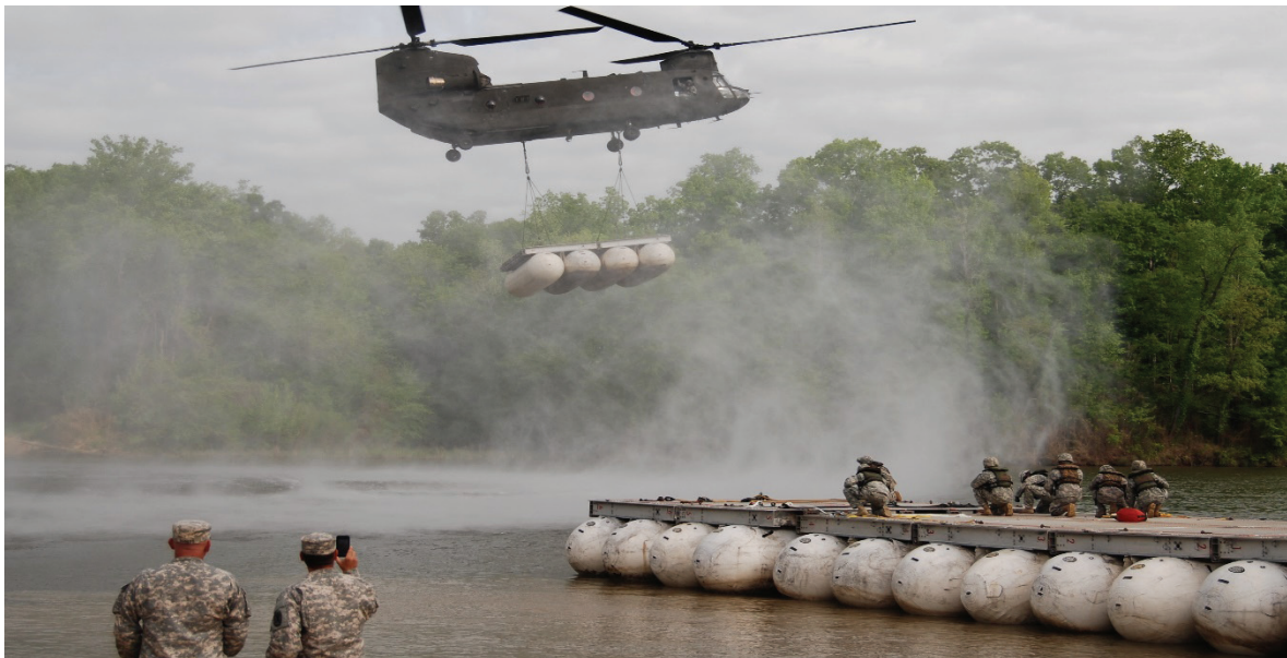
US Army helicopter delivery of LMCS (Light Weight Modular Causeway System) inflatable bridge sections.

This price list includes examples of the many boats we build. As you may know, we build to customer specs. , so if you do not see the boat to fit your requirements, give us a call. The boats we build are utilized in many working environments including: